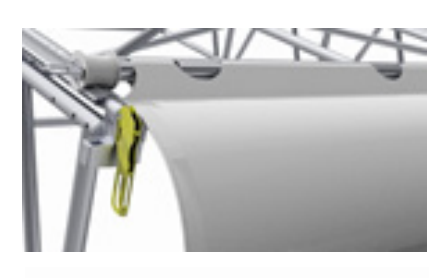
4) Connect rope to sheet tensioning bar and offer assembly to beam line, aligning wheel and sheet keder to the sheet track.

3) Engage spring pins with the integrated holes of the sheet tensioning bar.